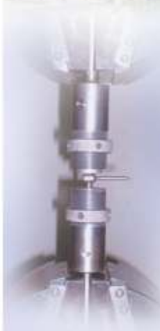
OneLock Multi-axial Screw undergoing an Axial Slip Test

Torsional Slip Test results for the OneLock screw-rod connection benchmarked with contemporary systems