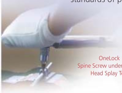
OneLock Spine Screw undergoing a Head Splay Test

As a responsible partner, we feel this is the least we should do to help you deliver the highest possible standards of patient care!